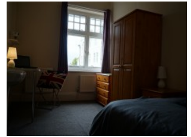
5 Addison Road Total floor area 320.0 sq. m. (3,444 sq. ft.) approx.