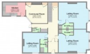
Ground Floor Floor area 158.0 sq. m. (1,701 sq. ft.) approx

Total floor area 370.0 sq. m. (3,983 sq. ft.) approx