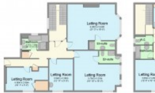
First Floor Floor area 125.0 sq. m. (1,345 sq. ft.) approx